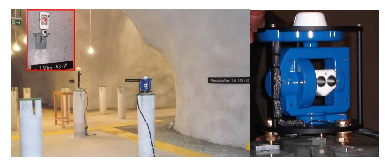
Figure 1: AutoDIF MKII installed at Conrad Observatory (WIC - Austria)