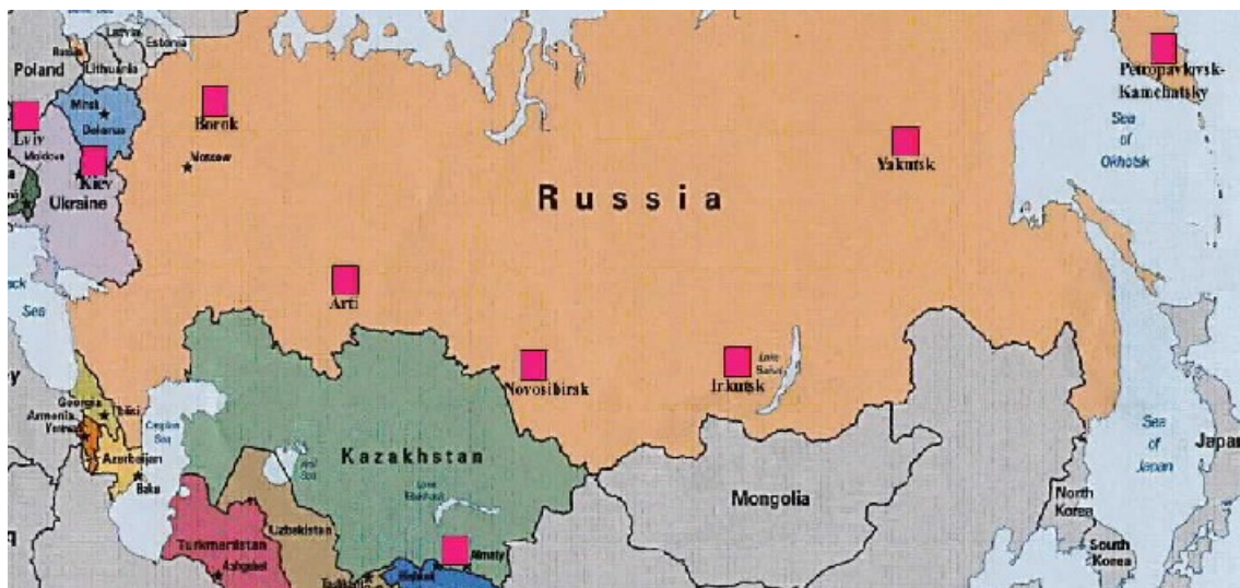
Figure 1. Magnetic Observatories targeted by the CRENEGON INTAS Infrastructure Action

The first presentation of the project was made by Alex Potapov & Valery Korepanov to the OPSCOM at the 1999 INTERMAGNET meeting in Budapest. It was improved during the 2000 Hurbanovo workshop in several discussions with Ole Rasmussen and Jacques Bitterly. A few months later IPGParis decided to